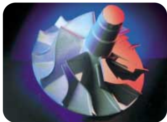
The new SV410 turbocharger with adjustable vanes and titanium compressor wheel.