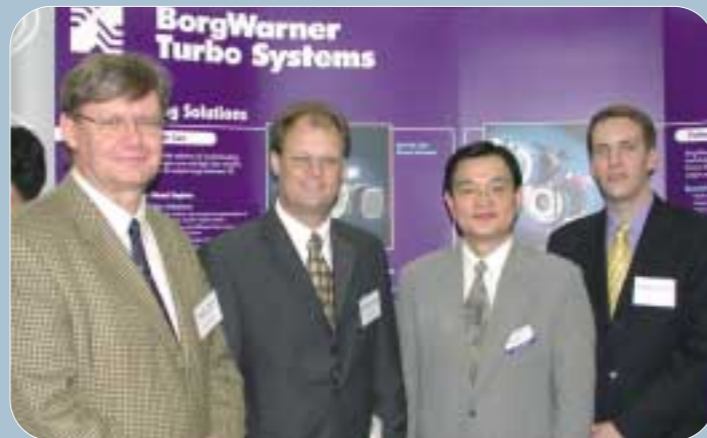
The information offered by the BorgWarner team was greeted with keen interest by the Koreans.

To accompany this trend, BorgWarner presented its entire product range for engines and drive trains at the sites of Hyundai and SsangYong in a Tech Review from 10 to 15 July 2002 in Korea.