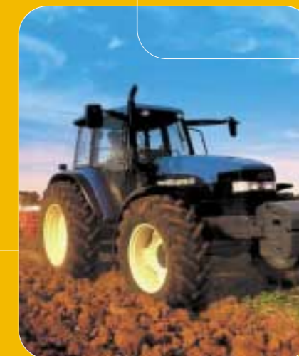
Agricultural machinery by Case New Holland carries out heavy work in some 160 countries across the globe, since 2002 with the assistance of turbocharging systems by Turbo Systems.

Following a successful development and testing program, the two turbochargers went into series production at the Kirchheimbolanden plant in May 2002. In Case New Holland, BorgWarner Turbo Systems has the backing of a market leader with confidence in its technological expertise and reputation for producing extremely high-performance and high-grade turbocharging systems.