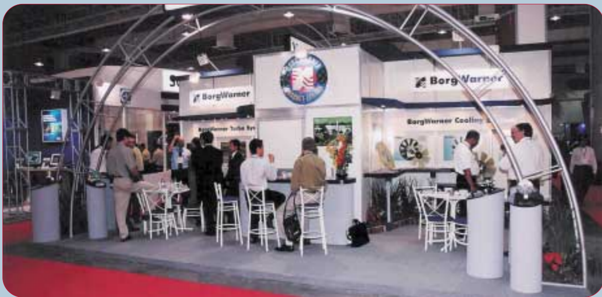
The BorgWarner stand became a platform for in-depth technical discussions.