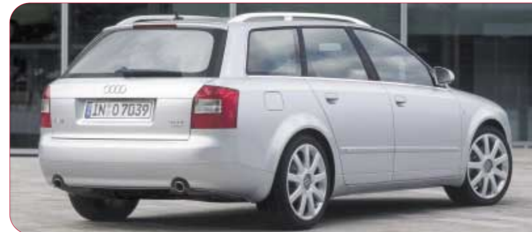
The new 1.8 Liter turbo engine with 190 bhp turns the Audi A4 into an elegant sports sedan.

For the launch of the new Audi A4, the well-known 1.8 liter turbocharged engine was fully reworked to provide 163 bhp (120 kw) and conform to the EURO4 emissions standard. Yet now there is a new, even more powerful version of the 1.8T engine on offer in the A4: With 190 bhp (140 kw) and an impressive torque figure of 240 Newton meters (177 foot-pounds) the new unit takes over the role of the top four-cylinder sports model. It helps the A4 sprint from 0-60 mph in under 8 seconds and achieve a top speed of 146 mph (236 km/h).