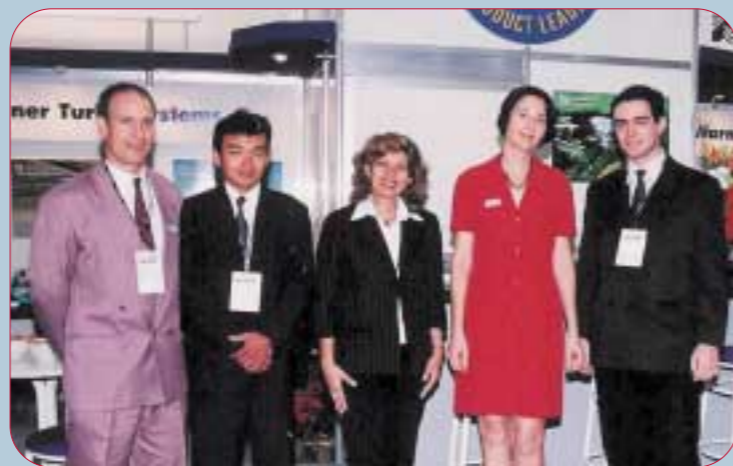
The Original Equipment Sales and Application Team answer visitors' questions.

BorgWarner's Original Equipment Sales and Application Team. Overall, the SAE established itself as a friendly meeting place for old and new business associates throughout the South American automobile industry.