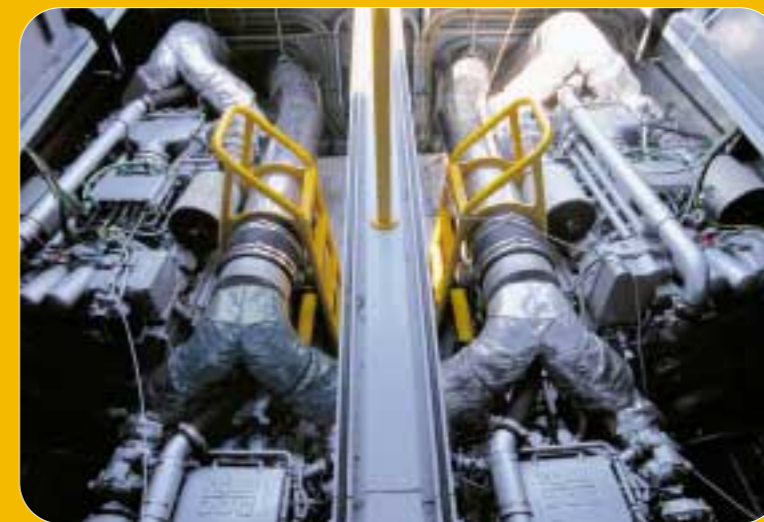
With around 6000 bhp the yacht "Record" sweeps across the water.